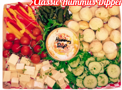
Classic Hummus Dipper