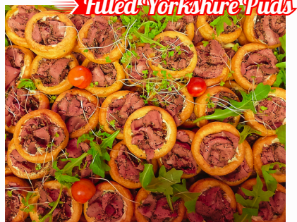
Filled Yorkshire Puds