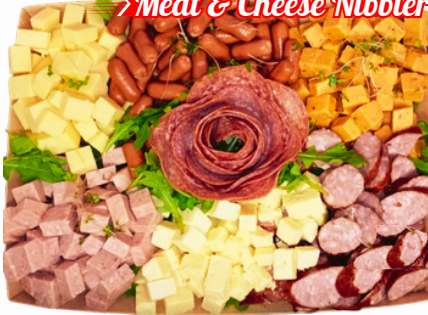
Meat & Cheese Nibbler