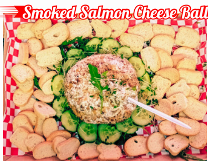
Smoked Salmon Cheese Ball