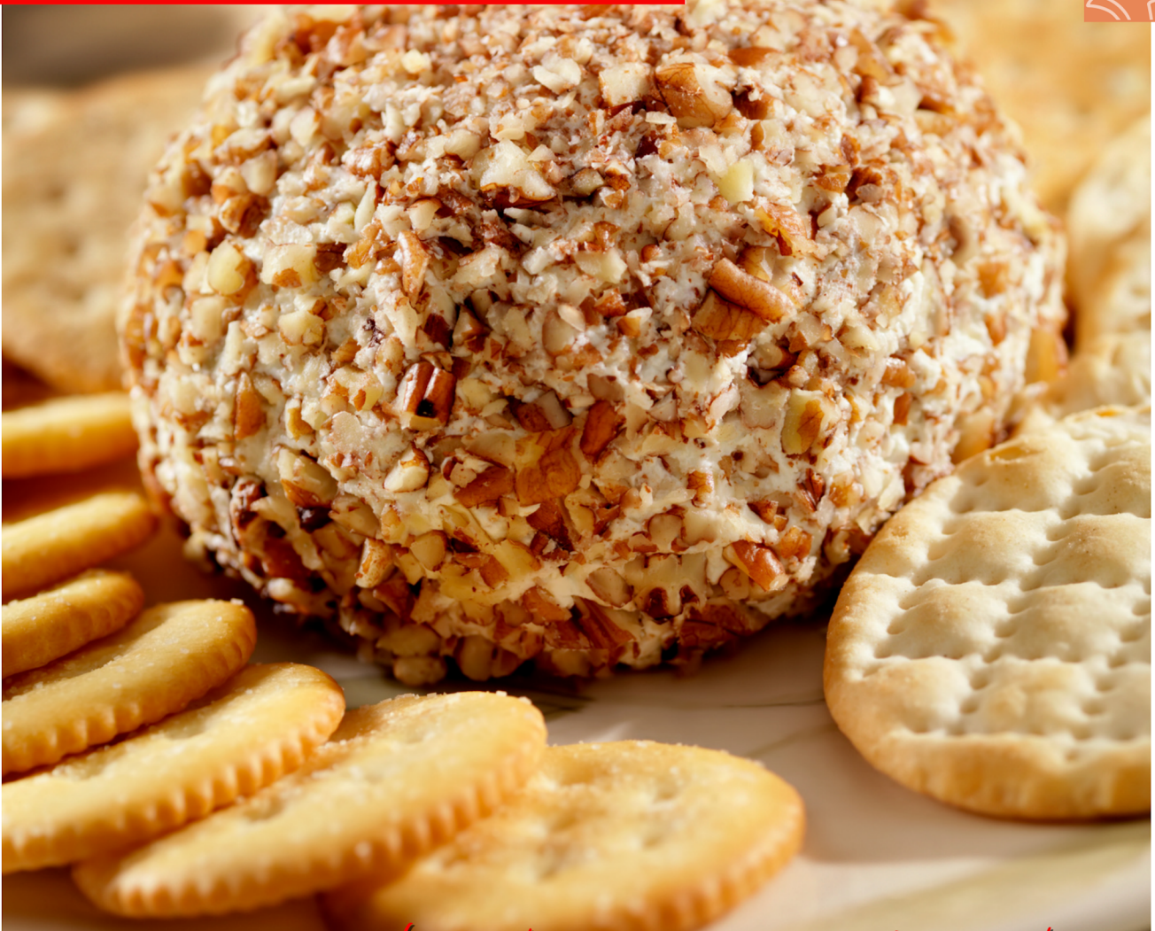
Smoked Salmon Cheese Ball