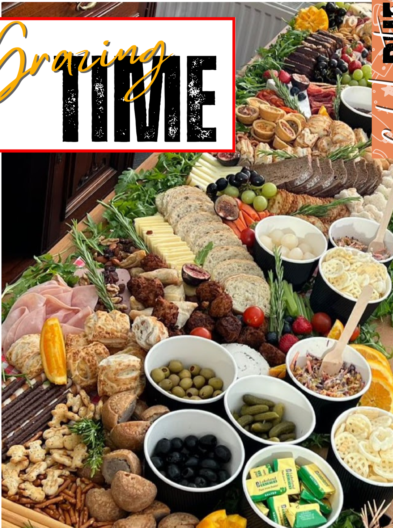
Grazing Table Runner