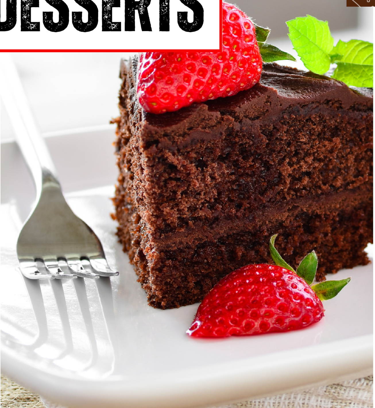
Chocolate Fudge Cake

ALLERGY INFORMATION AVAILABLE PLEASE ASK FOR DETAILS