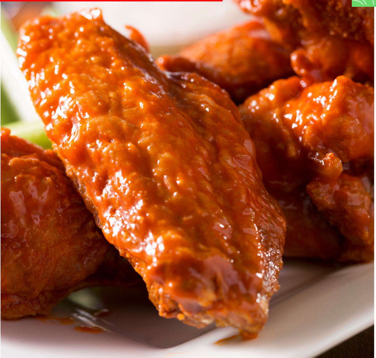
Spicy Chicken Wings

ALLERGY INFORMATION AVAILABLE PLEASE ASK FOR DETAILS