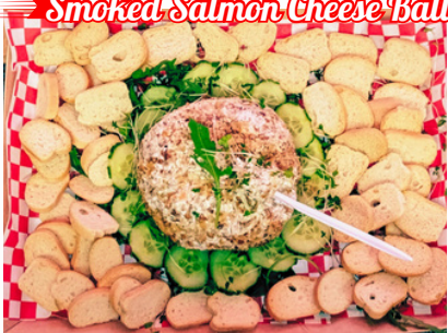
Smoked Salmon Cheese Ball