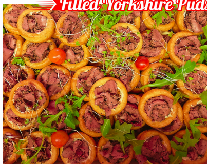
Filled Yorkshire Puds