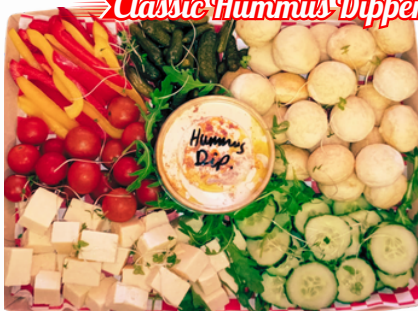
Classic Hummus Dipper